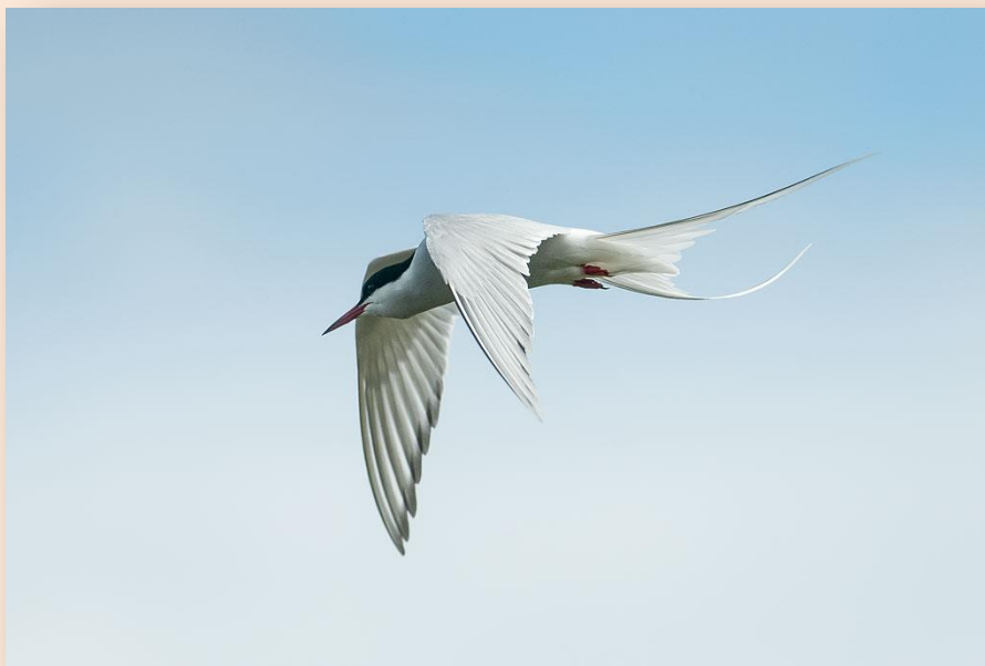
Hunting Arctic Tern

birds such a Whimbrel, Golden Plover and Lapwing. The quest here was to photograph the Ruby-throated Diver and the Red-necked Phalarope. A Phalarope whizzed by the window of the RSPB blind from where I was shooting, but an Arctic Tern working its way towards the blind hovered graciously over a series of ponds in compensation. Such is bird photography.