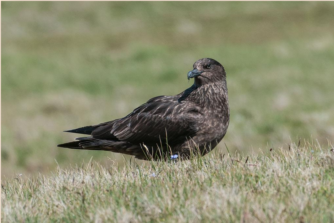
Great Skua on Noss Island