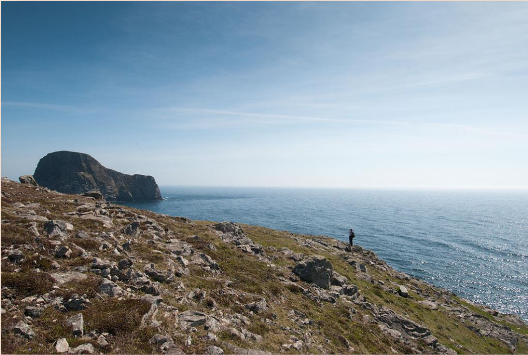
"A Given Day" on Fair Isle