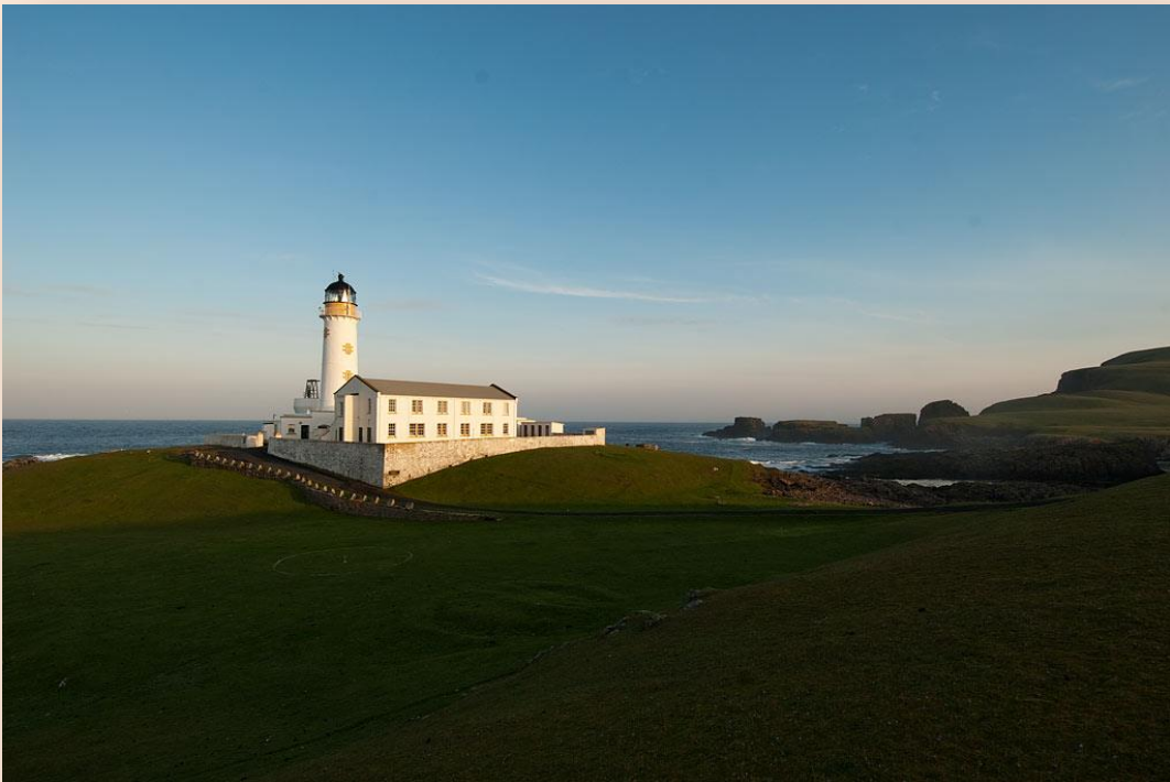
The South Lighthouse on Fair Isle