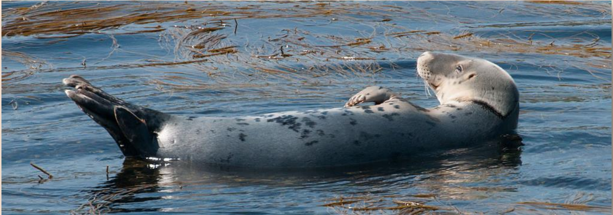
Harbour Seal enjoying a Given Day on Noss Island