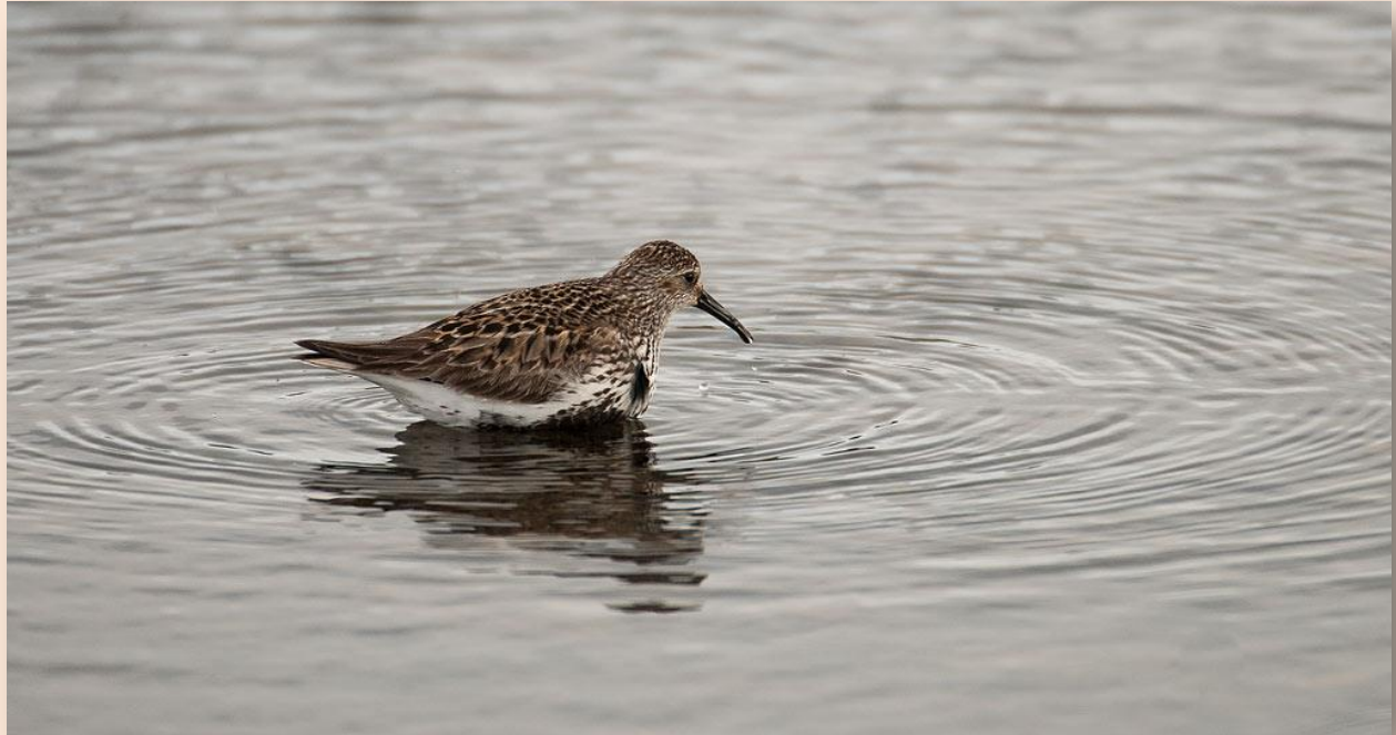
Wading Dunlin on Fetlar Island