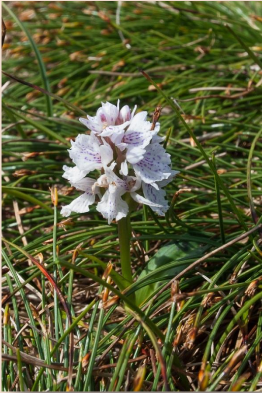
Heath Spotted Orchid on Unst