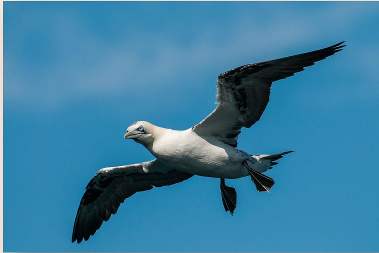
Soaring Gannet at Noup Head

A prime area on Westrey for photography is Noup Head at the very north end of the island where the land ends abruptly and drops in sheer cliffs into the sea. It's a haven for colonies of Razorbills, Guillemots, Fulmars, Puffins, Arctic Terns, Kittiwakes, and Herring gulls perched on the narrow ledges. Flight for soaring birds is effortless in the high winds. Just spread the wings and they're off. Gannets will ride the updraft close to the cliff walls giving a perfect shot with a moderate focal length