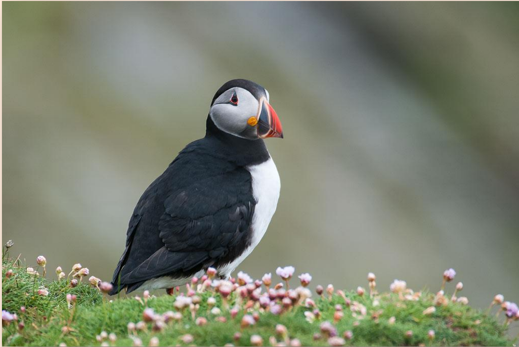
Atlantic Puffin at Sumburgh Head