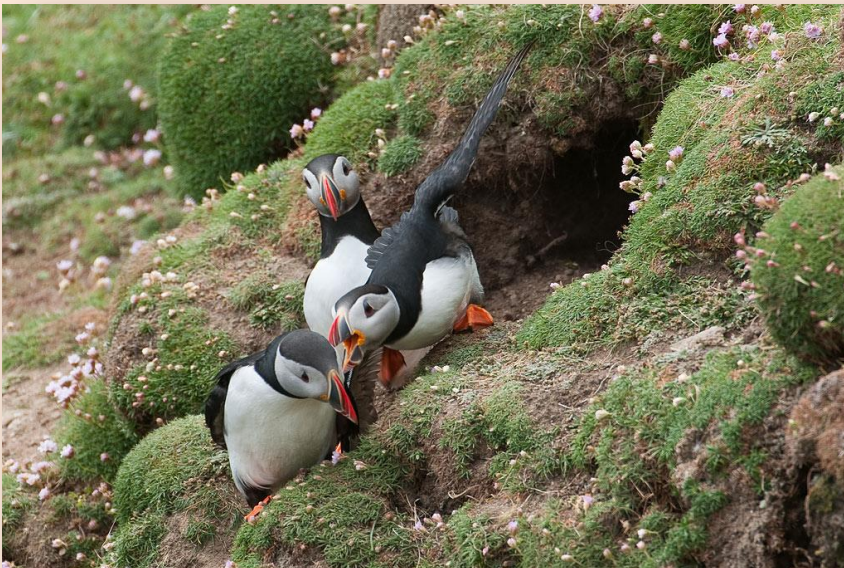
Squabbling Puffins at Sumburgh Head

Sumburgh Head, south of the Lerwick airport, is a prime area for Atlantic Puffins, even more so than