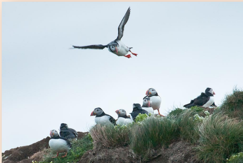
Puffin Colony at Castle of Burrian

Spring and summer are never overly warm in the Northern Isles, except on a “Given Day” when the sun shines and there is no wind. Today it was pleasant with scudding clouds and periodic bursts of sunshine as we boarded the car ferry for Westrey, the northernmost island in the group in search of seabird colonies. Castle of Burrian within 10 minutes from ferry landing hosts a colony of Atlantic Puffins. A