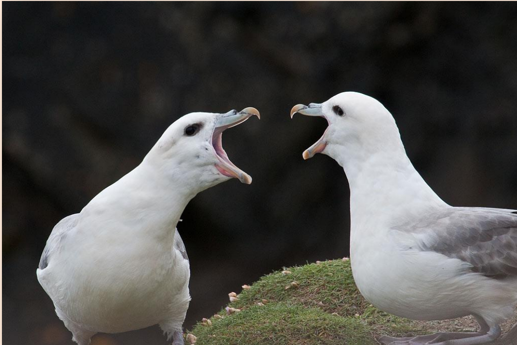
Head-waving Fulmars at Sumburgh Head