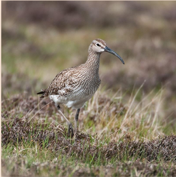
Whimbrel on Fetlar Island uplands