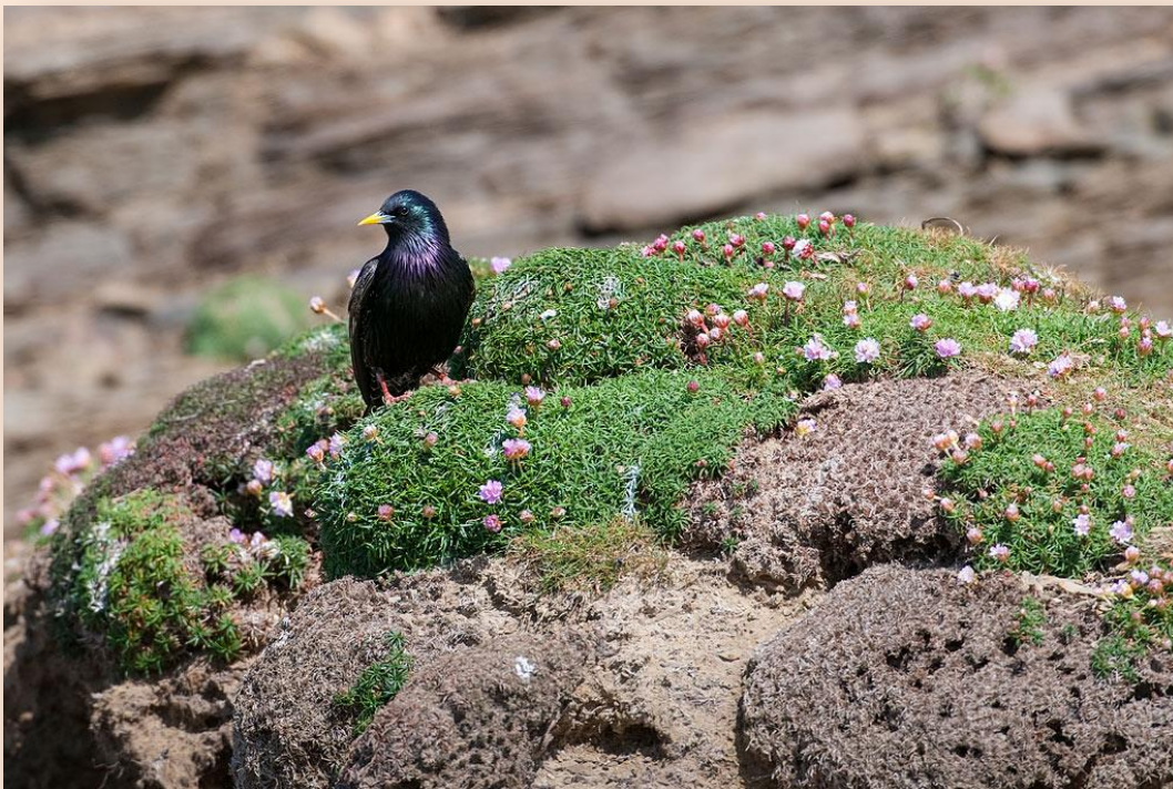
Starling in Nature's Sea Thrift Garden at Castle of Bunnian