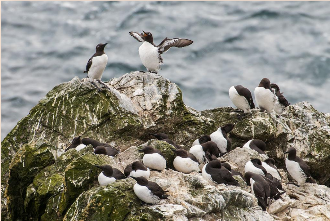
Guillemot colony at Sumburgh Head