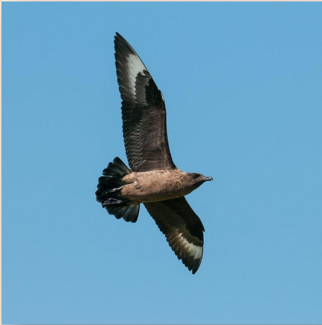
The Great Skua on the prowl

is to carry a walking stick and wave it over your head to fend off attacks. The Great Skua and the Arctic Skua are ferocious predators and have been known to devour chicks in a nest when a photographer got too close and chased the parent off. It was nesting season when we were there so we stayed well back. On this day the seals were basking in the sunshine and the Ruddy Turnstones were probing the seaweed. It was idyllic.